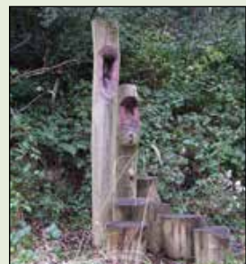
Woodland walk seat