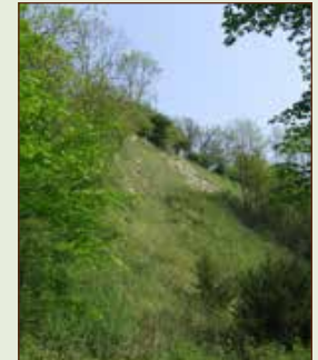
Side of Lincoln Hill