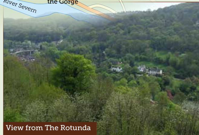
View from The Rotunda