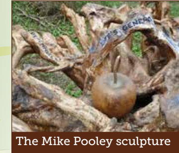
The Mike Pooley sculpture

Continue on the path until it forks, take the right fork following red way markers. Continue on past Castle Green cemetery, at the next fork bear right to Church Road. Carefully cross the road following fingerpost for The Rotunda View, enter Lincoln Hill woodland through a kissing gate.