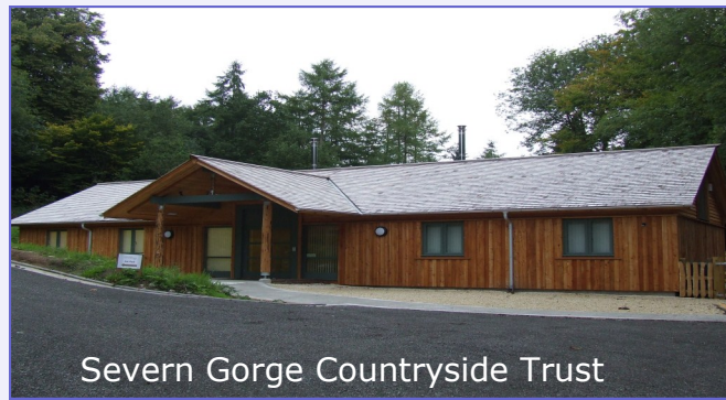
Severn Gorge Countryside Trust