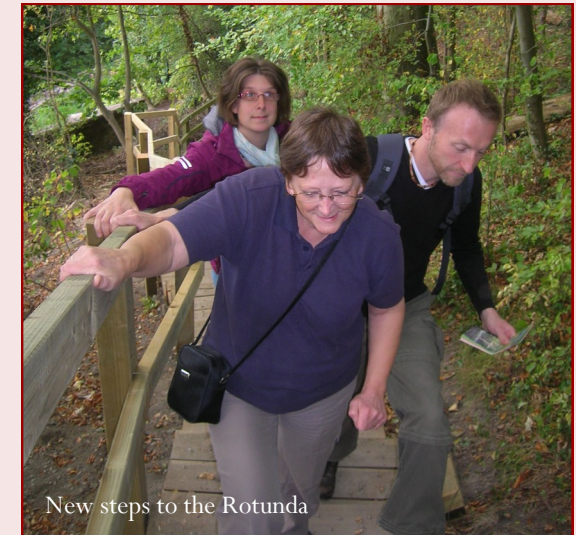
New steps to the Rotunda